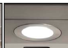
0.5W LED lights