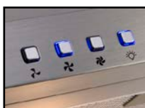
Electronic button front control